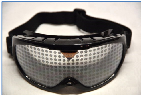
Drug Consume Simulation : € 25*