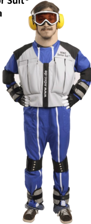
Senior Suit® Alpha

Rent: € 400 for max 1 week, all over Europe, freights both ways included