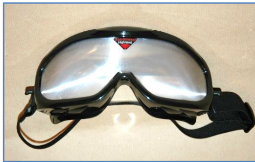
Drunkeness Simulation : € 25*