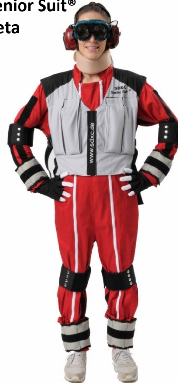
Senior Suit® Beta

Rent: € 500 for max 1 week, all over Europe, freights both ways included