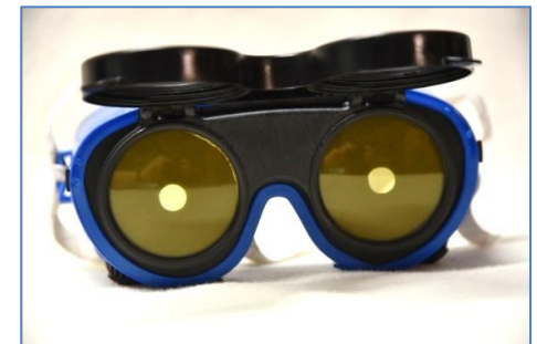
Severe Macula Degeneration : € 50*