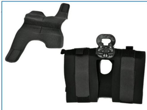
Hemiparesis-Set : € 50*