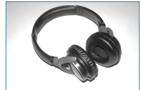
8 sounds of tinnitus: € 25*