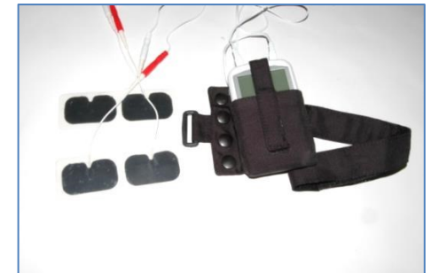
Parkinson tremor simulation: € 50*

* Prices are per rental together with an age simulation suit