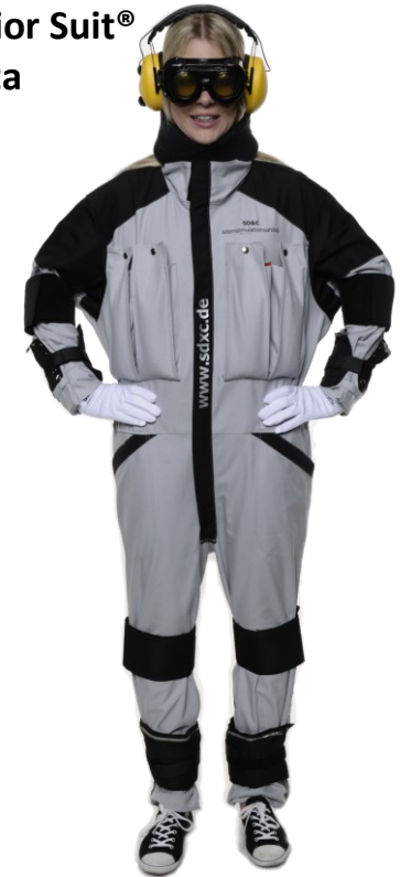
Senior Suit® Delta

Rent: € 600 for max 1 week, all over Europe, freights both ways included