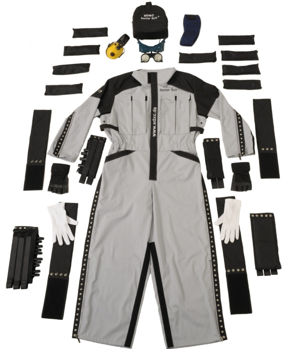
Components of the SD&C Senior Suit® Delta